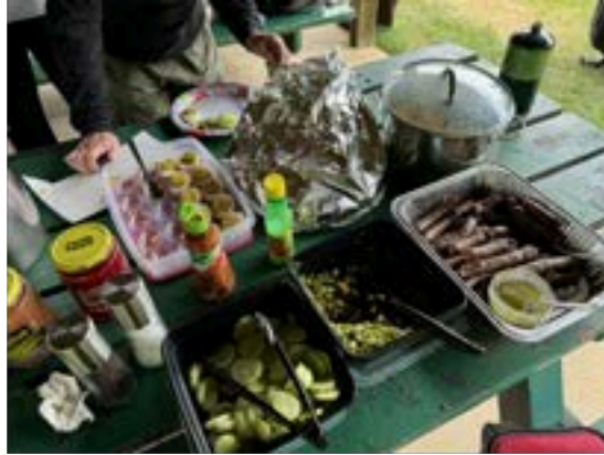
Cooks Guild Andalusian Day Board