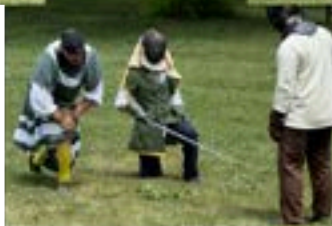
Chivalry is always in style in Sylvan Glen.